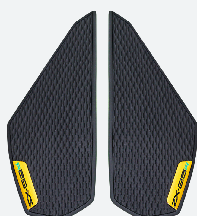
Tank Pad CNC