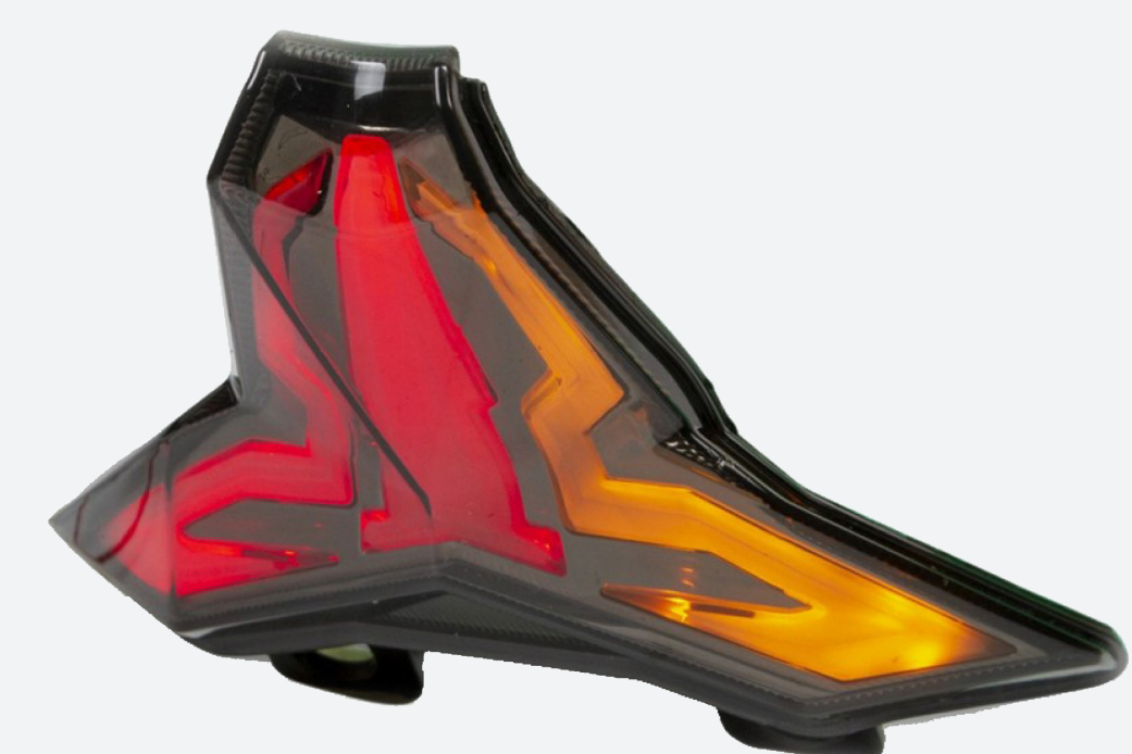
Stoplamp Type Z