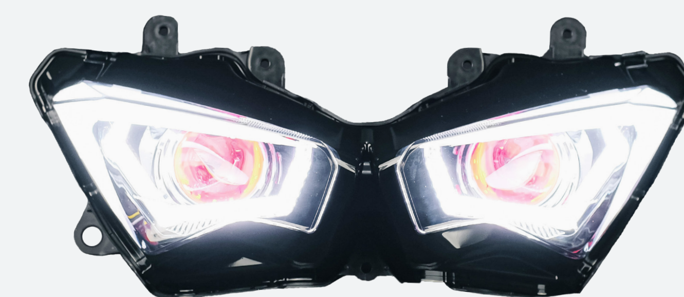
Eagle Eyes Headlamp