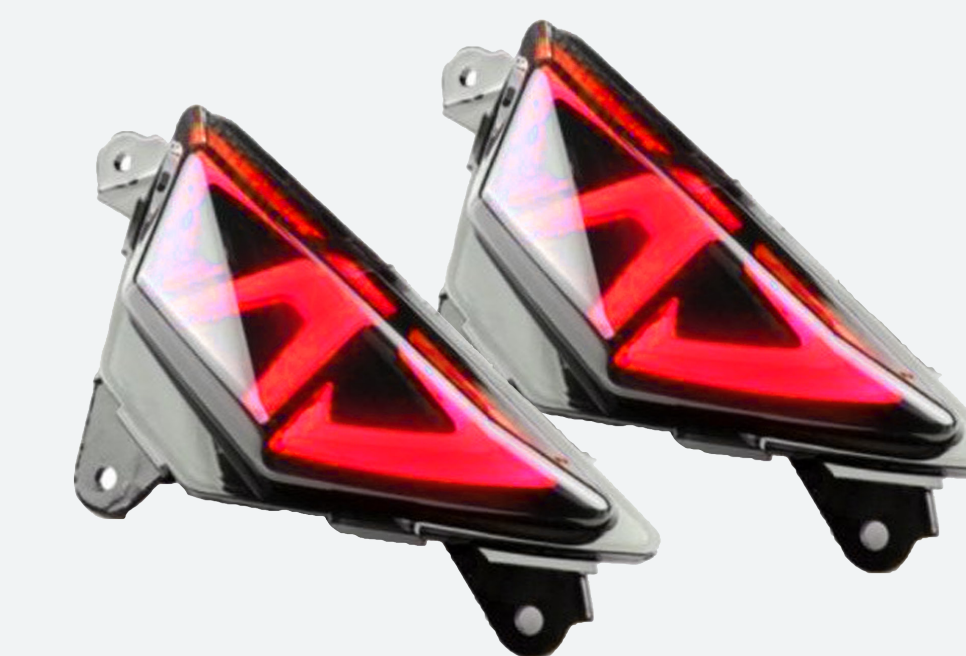
Turn Signal Lamp LED Running