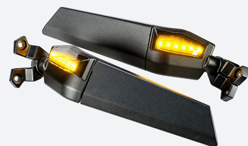
Winglet Mirror LED