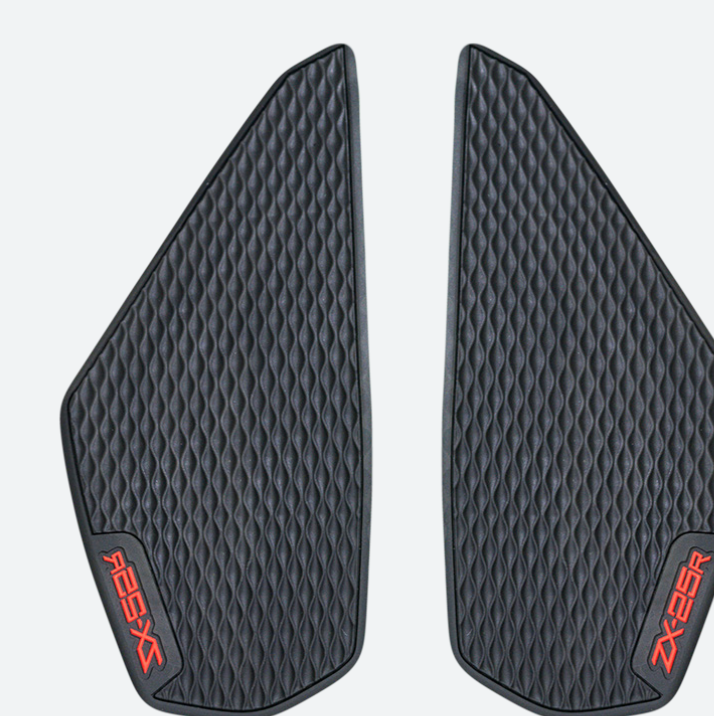
Side Tank Pad