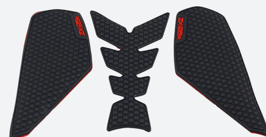
Complete Tank Pad